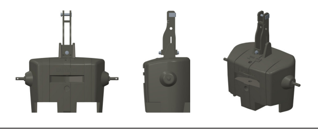
BIGPACK 1800 KG available in :